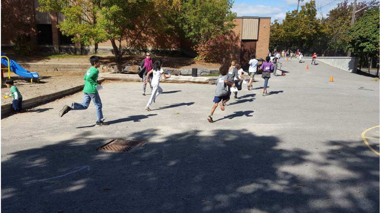
Terry Fox Run